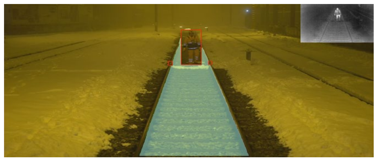
Human & braking shoes detection at night and in harsh weather conditions

The first 2 are located in the locomotive cabin providing the driver with visual and audio alerts in real-time. The third display is mounted to a remote control with integration of Schweizer Electronic. Thus, the shunting operation can be controlled from a remote location near the wagons using only the remote control equipped with Rail Vision visual data. The solution allows the entire shunting process to be operated by one person. At the request of SBB Cargo AG and in