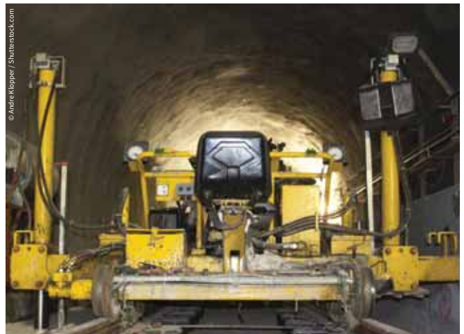
Comprehensive underground construction work was performed on the underground sections of the Gautrain, including tunnel boring machines and drill and blast methods