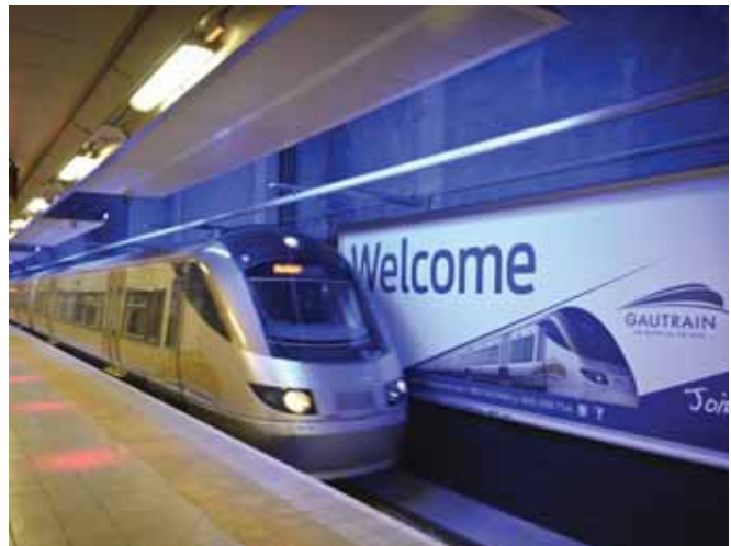
Three of the 10 Gautrain stations are underground

In Johannesburg, four buildings were demolished to make way for the new Gautrain Park Station. The method of demolition was an